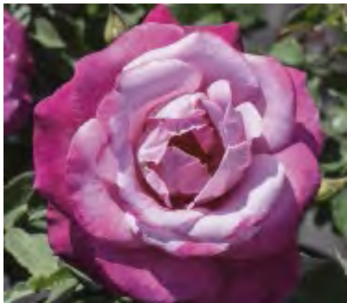
FRAGRANT PLUM cv. 'AROpium'

Height/Habit: Medium; Upright, bushy Bloom/Petals: Medium old-fashioned; Over 35 Foliage: Deep green, semi-glossy Fragrance: Strong spicy clove