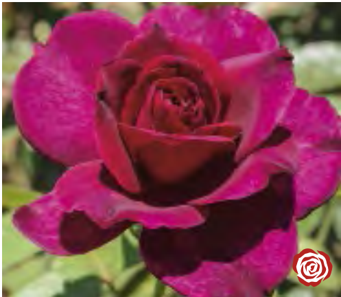
INTRIGUE cv. 'JACum'

This beguiling rose won the Fragrance Medal at Madrid for its distinctive lemony scent; but it also boasts unique wine-dark buds, exotic plum purple blooms, and elegant long stems, all of which makes this an exceptional rose.