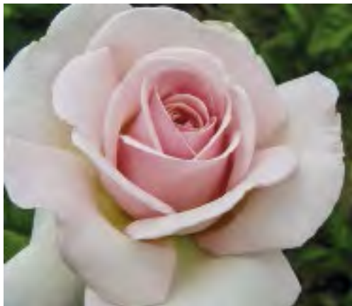
MEREDITH cv. 'WEKmeredoc'

Height/Habit: 4-5', upright Bloom/Petals: 7-8"; 25-35 Foliage: Dark green Fragrance: Moderate fruity