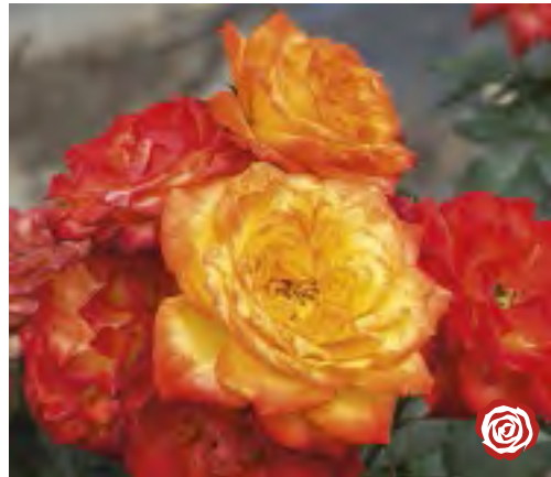
CHARISMA cv. 'JElroganor'

Height/Habit: Tall; Vigorous Bloom/Petals: 3.5-4" cupped; 48 reflexed Foliage: Dark, glossy, leathery Fragrance: Moderate spice