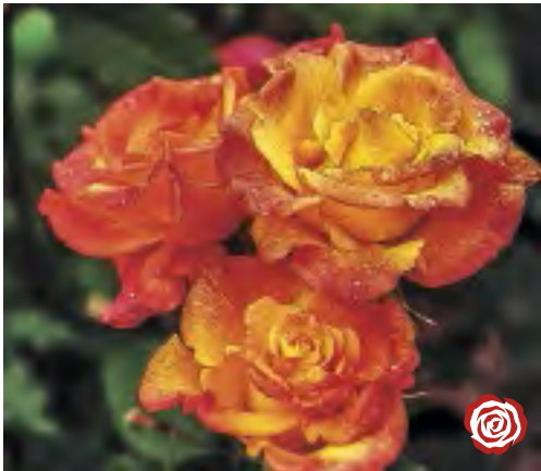
RIO SAMBA™ Hybrid Tea

A work of art, this beautiful hybrid tea exhibits elegant long stems and big plump buds that unfurl into extra large—sometimes reaching 8 inches—velvety dark red blooms, and its rich fragrance will waft through a garden or fill a room. Height/Habit: Medium; Upright, vigorous Bloom/Petals: Large high-centered; 45-50 reflexed Foliage: Large, dark, leathery Fragrance: Intense