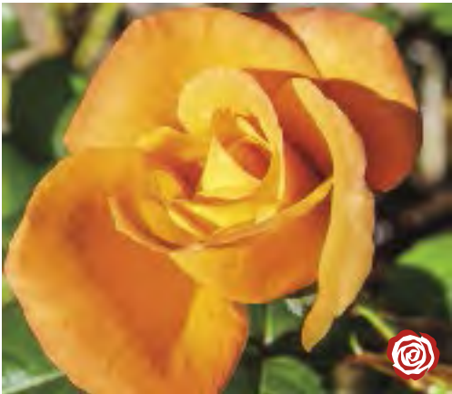
NEW YEAR cv. 'MACnewye'

Height/Habit: Upright Bloom/Petals: 4-5" high-centered; 30 reflexed Foliage: Large, light Fragrance: Intense