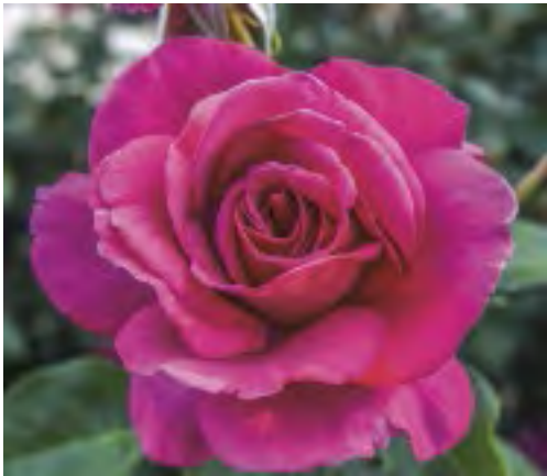
MIRANDA LAMBERT™ cv. 'TEXmirlam' PP#28,660

Height/Habit: 4-5'; upright Bloom/Petals: 4.5-5" high-centered; 30-35 reflexed Foliage: Medium size, dark green, glossy Fragrance: Light