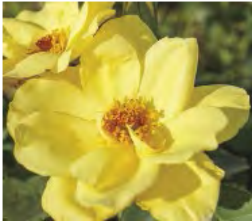
CAREFREE SUNSHINE™ Shrub

No, it isn't a dream. This variety really does combine the form of a hybrid tea with the free-flowering habit of a floribunda and the hardiness and vigor of a shrub - all in one bush! And the blooms are worth repeating: borne in small clusters, they are large and perfectly cupped with medium pink petals and a scrumptious raspberry fragrance. Very disease resistant. Height/Habit: 5' h x 4' w; Bushy Bloom/Petals: 3.25-4.25" cupped; 40+ reflexed Foliage: Medium green, matte Fragrance: Moderate raspberry