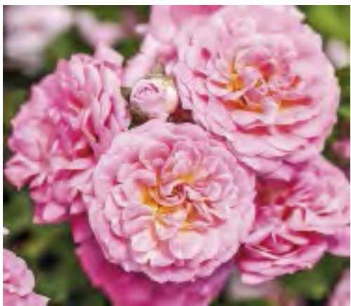
SWEET DRIFT® cv. 'Meisweldom' PP#21,612

Height/Habit: 3-4' h x 3-4' w; Bushy Bloom/Petals: Medium; 5-7 Foliage: Dark, semi-gloss Fragrance: Moderate