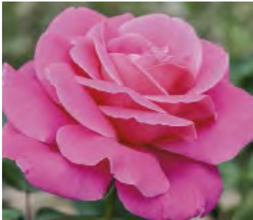
PINK PEACE Hybrid Tea

This grandiflora rose has strong yellow blooms as bold and bright as its namesake! Phyllis Diller is a golden beauty with a moderate fragrance. Great for cutting. Height/Habit: 3-4.5'; medium, bushy Bloom/Petals: 4.5-5", double; 17-25 reflexed Foliage: Large, glossy, dark green Fragrance: Moderate