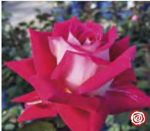
LOVE cv. 'JACTwin'

Height/Habit: Medium; Rounded Bloom/Petals: 4-4.5"; 25-30 frilly Foliage: Medium size, medium green, semi-glossy Fragrance: Moderate sweet & citrus