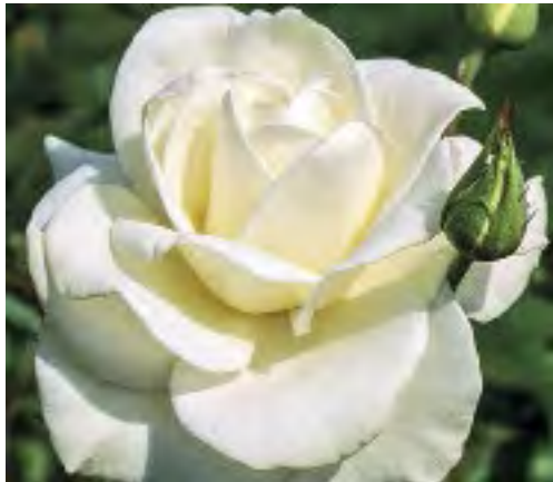
JOHN F. KENNEDY

Borne on strong, vigorous stems, the elegant blooms are large and pure white, with a slight green tint in the early bud stage. Very fragrant for a white rose.