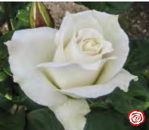
PASCALI cv. 'LENip'

Height/Habit: Upright Bloom/Petals: 3.5-4.5" high-centered; 25-30 reflexed Foliage: Dark, glossy Fragrance: Moderate fruity