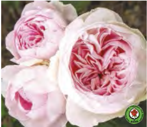
EARTH ANGEL™ PARFUMA® cv. 'KORgeowim' PP#26,636

Height/Habit: 4' h x 3' w; Upright, dense Bloom/Petals: Large high-centered; 50+ Foliage: Medium, dark, matte Fragrance: Citrus with classic rose scent