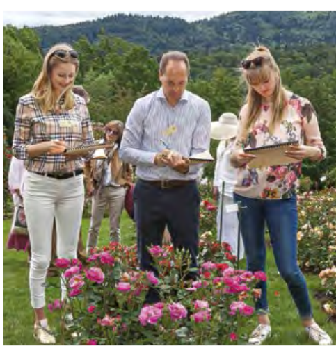
Hague Rose Trials, Netherlands

For over 100 years, Tantau Roses has been dedicated to breeding garden and cut roses and has established itself as a worldwide leader in hybridizing award-winning varieties. Located in Uetersen, Germany, all Tantau varieties are carefully selected and tested in different regions to ensure exceptional performance. In 2020, Certified Roses introduced two outstanding Tantau Hybrid Tea roses to the U.S. market: Forever Yours™ and Scentuous™.