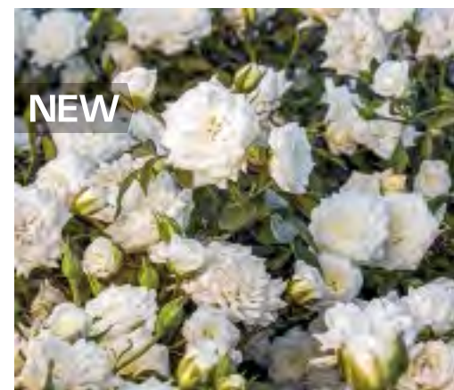
WHITE DRIFT® ROSE cv. 'MEIzorland' PPAF

Height/Habit: Small very full Bloom/Petals: .75", clusters; 41+ Foliage: Glossy dark green Fragrance: None