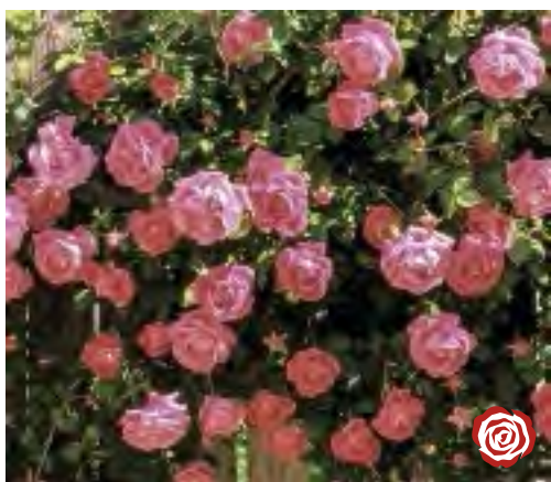
CL. AMERICA™ cv. 'JACdam'

Climbers grow vigorously, ranging in height between 6 and 14 feet, and produce high-quality blooms of variable size and form. They are versatile roses that can be used on trellises, poles, arches, and pillars but can also be trained to grow along fences or walls.