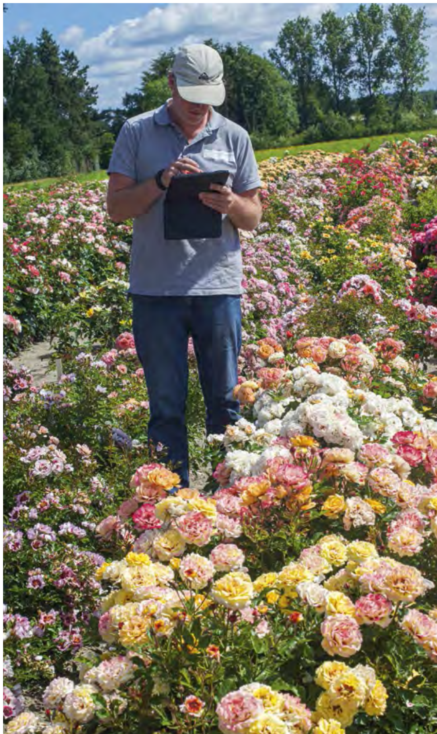
Interplant's rose fields in Harmelen, Netherlands