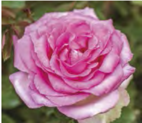
BEVERLY® ELEGANZA® cv. 'KORpauvio' PP#23,495