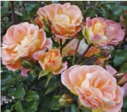
PEACH DRIFT® ROSE Shrub

Bright coral-orange blooms cover this small mounding shrub from mid-spring to mid-fall. Coral Drift has vibrant flowers that catch your eye from anywhere. Mix and match with similar or contrasting colors to really wow. Fully winter hardy and disease resistant. Height/Habit: 1.5' h x 2.5' w Bloom/Petals: 1.5", clusters Foliage: Medium, dark Fragrance: None