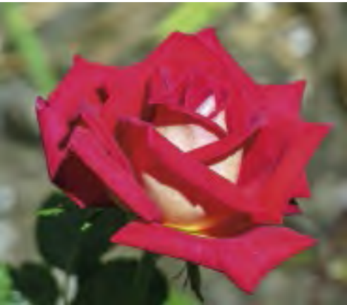
NINETY-NINER cv. 'WEKwinwin' PP#11,382

Height/Habit: Upright Bloom/Petals: Medium high-centered; 20 reflexed Foliage: Large, dark, glossy Fragrance: Light