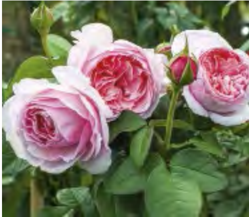
SCENTUOUS™ cv. 'TAN97281'

Height/Habit: 6' h x 3' w Bloom/Petals: Medium; full 26-40; Orange Foliage: Lush, deep green Fragrance: Mild