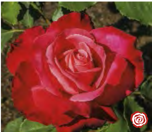
MON CHERI™ cv. 'AROcher'

Height/Habit: Tall; Upright, vigorous Bloom/Petals: 4.5-6" cupped; 35 reflexed Foliage: Dark, matte, leathery Fragrance: Intense damask rose