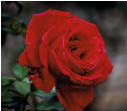
PROUD LAND Hybrid Tea

What a flirt! Did that rose just wink its golden yellow 'eye' ? This is an incredibly charming rose. Its bountiful blossoms are attractively colored flame orange with scarlet shading. Height/Habit: 3-4' Bloom/Petals: 3.5" open; 7-12 plain Foliage: Dark, glossy Fragrance: Light apple