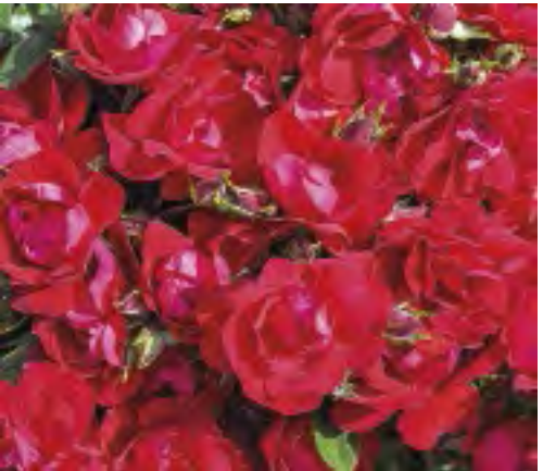
KARDINAL™ KOLORSCAPE® cv. 'KORSixkono' PP#23,548

Height/Habit: 3' h x 2 1/2' w; Compact, mounding Bloom/Petals: Approx. 20 petals; semi-double Foliage: Dark green, glossy Fragrance: None