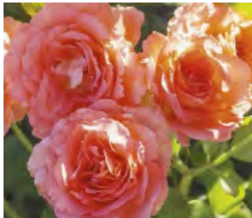
WAIHEKE cv. 'MACwaihe'

Height/Habit: Medium; Upright, vigorous Bloom/Petals: 5" high-centered; 33 reflexed Foliage: Dark, glossy, leathery Fragrance: Intense fruity