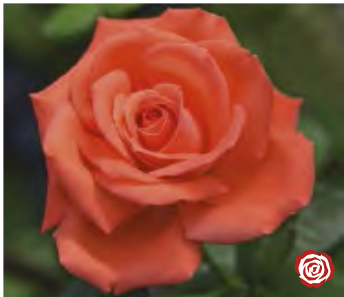
TROPICANA cv. 'TANorstar'

Height/Habit: Tall; Upright, bushy Bloom/Petals: 4.5-5.5" high-centered; 33-35 reflexed Foliage: Large, dark, semi-glossy Fragrance: Light tea