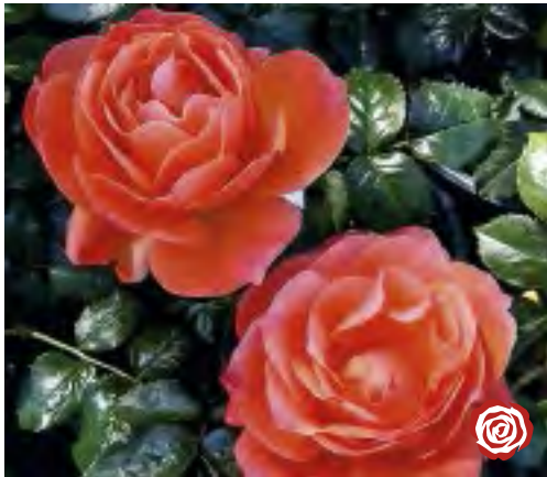
LIVIN' EASY™ cv. 'HARwelcome'

If you're into hammocks, ice cold drinks and stopping to "smell the roses" in life, this rose is for you. Its frilly orange-apricot blooms will have you enjoying the view, but its black spot resistance will have you livin' easy. Excellent for the landscape and mass plantings. Does well in all climates.