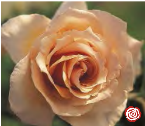
MEDALLION Hybrid Tea

Height/Habit: 3-5' h x 4' w; Bushy, vigorous Bloom/Petals: Large cupped; 55 reflexed Foliage: Leathery Fragrance: Intense