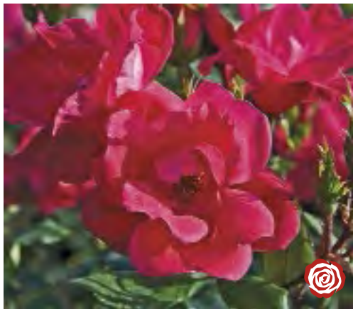
KNOCK OUT® ROSE Shrub

The double cherry red blooms have a more traditional form than the blooms of the original Knock Out. The bush has the same excellent black spot resistance as the original but is slightly more winter hardy. Height/Habit: 3-4' h x 3-4' w; Bushy, rounded Bloom/Petals: Medium-small; 15-20 Foliage: Deep purplish green Fragrance: None