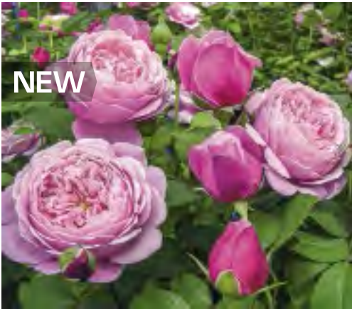
CATHEDRAL BELLS™ cv. 'DElamo' Shrub

Supremely luscious, very full and cupped pink blooms with a strong fragrance of anise and lavender delight in the garden. Vigorous growth habit and an upright, arching form with good disease resistance. Use with a trellis in containers or along fences.