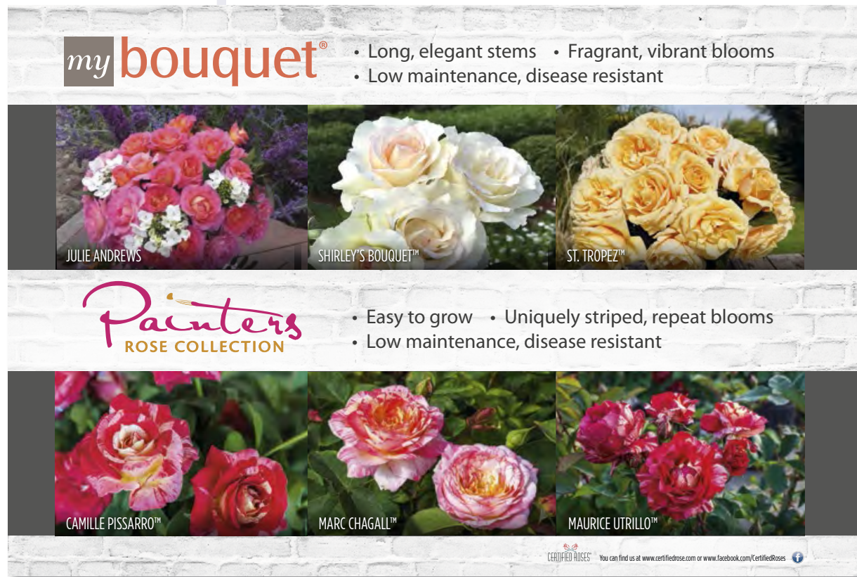
My Bouquet® and Painters Rose Collection Banner

You can find us at www.certifiedrose.com