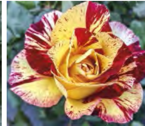
CAMILLE PISSARRO™ cv. 'DELstrial'

Height/Habit: 3-4'; compact Bloom/Petals: 25 to 30 petals Foliage: Lush, glossy green Fragrance: Moderate