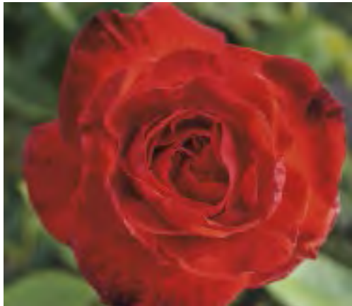
CAMARA cv. 'DELcamar'

Height/Habit: 7' h x 4' w Bloom/Petals: Large; full 30-40 Foliage: Glossy, dark green Fragrance: Mild to sweet