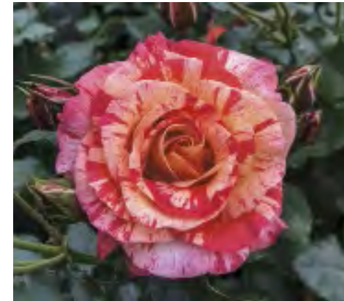
ALFRED SISLEY™ cv. 'DELstrijor'