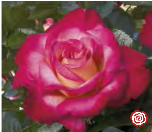
DICK CLARK cv. 'WEKfunk' PP#23,455

Height/Habit: 4-5'; tall, upright Bloom/Petals: 4-5"; large, full; 26-40 Foliage: Dark green, glossy Fragrance: Strong