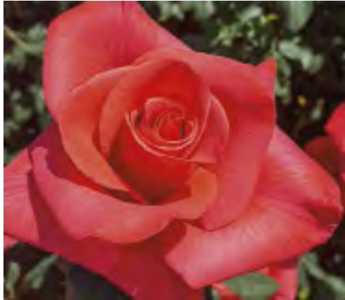
RING OF FIRE™ cv. 'GREhotmar'

Height/Habit: 3-4'; upright Bloom/Petals: Large, 5 in. diameter Foliage: Dark glossy green Fragrance: Intense rose and fruit