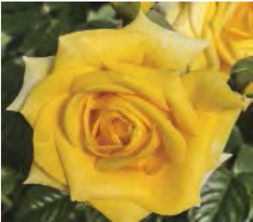
FIRST IMPRESSION™ cv. 'SPRoimpress' PP#21,708 Floribunda

Height/Habit: 1-2'; compact Bloom/Petals: Clusters, single bloom form Foliage: Medium green, glossy Fragrance: Mild