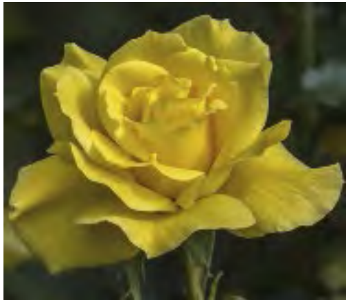
SUNSPRITE cv. 'KOResia'

Height/Habit: 4-5'; upright Bloom/Petals: 4" high-centered; 35 reflexed Foliage: Large, leathery Fragrance: Intense fruity