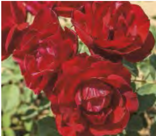
CL. BLAZE Climber

Blaze is an extremely popular climber in America, maybe because it is happy most anywhere it is planted. Its short ovoid buds open to extravagant blooms that are neatly cupped and cheerfully shaded brilliant fiery red. Blooms in large clusters on old and new wood.