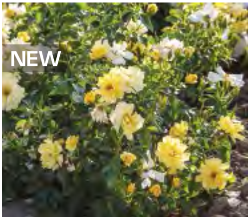
LEMON DRIFT® ROSE Shrub

A continuously blooming compact and easy to grow bush with bright cherry-red to hot-pink blooms. Disease resistant, drought tolerant, and self-cleaning. Height/Habit: 3-4' h x 3-4' w; Bushy, rounded Bloom/Petals: Medium; 5-7 Foliage: Deep purplish green, glossy Fragrance: None