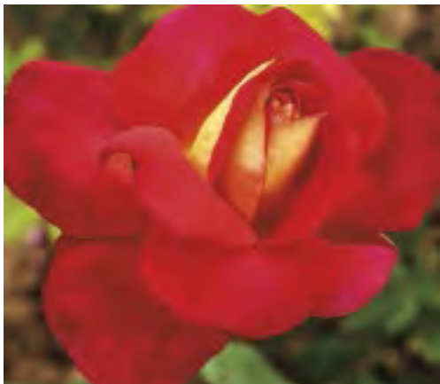
NOVELTY™ cv. 'WEZnov' PPRR

Height/Habit: 3-5' h x 4' w; Upright, bushy, vigorous Bloom/Petals: 6" high-centered; 30-35 reflexed Foliage: Large, dark, glossy Fragrance: Light fruity