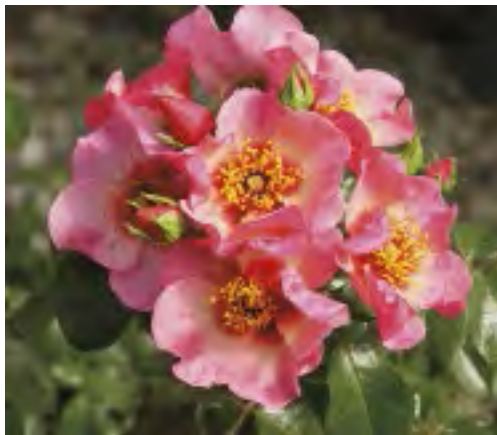
RASPBERRY KISS® Shrub

Blooms in flushes throughout the season. Small ovoid buds. Great ground cover. Height/Habit: Bushy rounded Bloom/Petals: 2" Medium double; 17-25 Foliage: Glossy dark green Fragrance: None