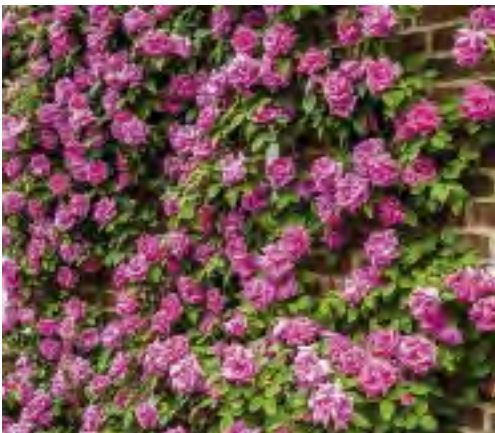
CL. ZÉPHIRINE DROUHIN Semi Climber

Height/Habit: 8-10'; upright Bloom/Petals: Medium high-centered; 6-14 reflexed Foliage: Large, dark green, glossy Fragrance: Mild