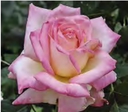
KORDES' PERFECTA cv. 'KORalu'

Kordes' Perfecta lives up to its name with its symmetry of form, pleasing perfume, and eye-catching color. Each large creamy bloom is heavily flushed with crimson. The bush is suitable for hedges, beds, borders, cutting, and exhibition.