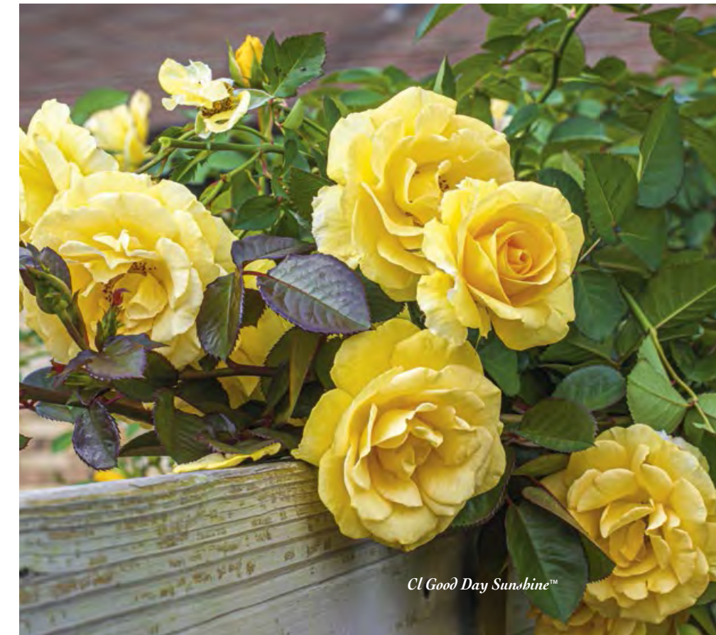
Cl Good Day Sunshine™

Height/Habit: 8-10' Bloom/Petals: 3" open; 25-30 reflexed Foliage: Soft, light Fragrance: Strong damask