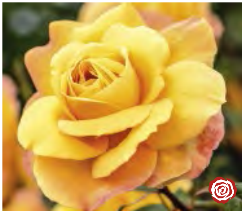
STRIKE IT RICH™ Grandiflora

Ok, so maybe it can't perform miracles, but it does have a pretty nifty trick: It turns green. That's right. This novel, heat-lovin' variety's golden yellow blooms, which slowly spiral open from chartreuse buds, take on a lovely green hue as the temperature rises. Height/Habit: 3-4' h; Rounded to upright, bushy Bloom/Petals: 5" high-centered; 30-35 reflexed Foliage: Large, grey-green, matte Fragrance: Light