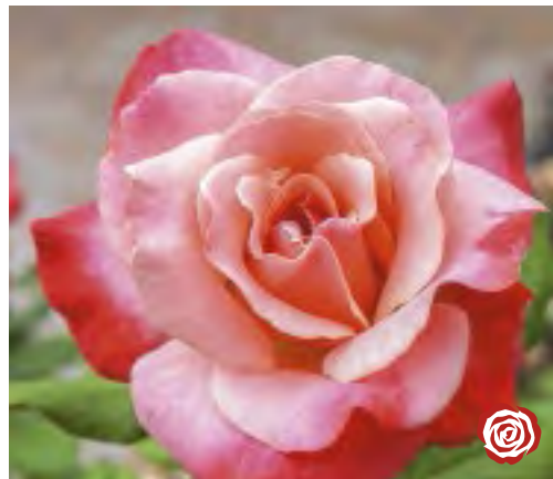
COLOR MAGIC cv. 'JACmag'

Height/Habit: 2.5-6' h x 2-4' w; Vigorous, compact Bloom/Petals: 4.5-5" high-centered; 45-50 reflexed Foliage: Dark, matte Fragrance: Intense damask rose