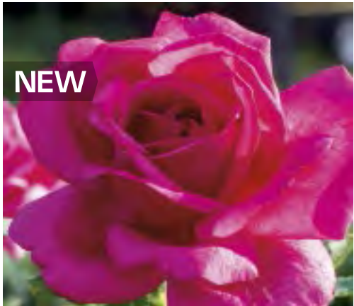
GIVENCHY cv. 'AROdousna'

Large-flowered Hybrid Tea with red blend that blooms in flushes throughout the season. Each flower has approximately 30 petals with multiple blooms per stem. Exceptional, spicy fragrance.