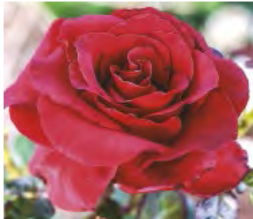
BLACK MAGIC™ cv. 'TANKalcig'

Height/Habit: Tall; Upright, vigorous Bloom/Petals: Medium high-centered; 25-30 reflexed Foliage: Emerald green, glossy, leathery Fragrance: Intense sweet