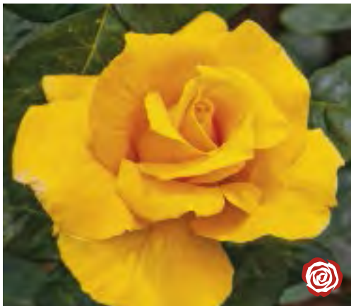
MIDAS TOUCH™ cv. 'JACTou'

Height/Habit: 3-4'; upright, rounded Bloom/Petals: 5-7", double, approx. 30 Foliage: Semi-glossy, medium green Fragrance: Strong, sweet rose