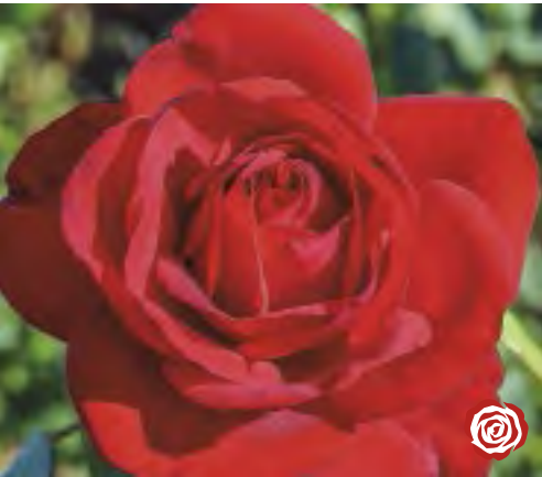
OLYMPIAD cv. 'MACaud'

Height/Habit: 3-4'; upright, bushy Bloom/Petals: 3-4"; double, high-centered; 26-35 Foliage: Deep green Fragrance: Mild