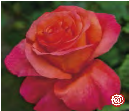
SUNDOWNER cv. 'MACheup'

Like a magnificent summer sunset, Sundowner flaunts colors of warm gold and apricot-orange with touches of salmon. The large exhibition-form blooms are borne singly and in large clusters.