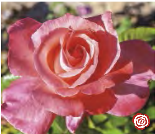
TOUCH OF CLASS cv. 'KRICarlo'

One of the top-rated exhibition roses of all time. The large beautifully formed flowers slowly spiral open in distinctive swirls of blended cream and pink to finish warm coral. Excellent for cutting.