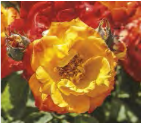
CL. PIÑATA Climber

Height/Habit: 6-10' Bloom/Petals: 4-4.5" cupped; 25-28 plain Foliage: Medium, bright green, glossy Fragrance: Moderate sweet