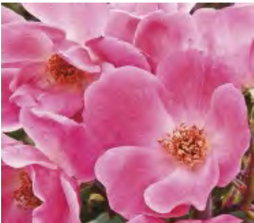
PINK KNOCK OUT® ROSE Shrub

Petite clusters of buttery to lemon-yellow blooms on a bushy, rounded and compact habit. Perfect as a low border, as groundcover or in patio containers. Versatile and easy to grow. Height/Habit: 1.5-2.5'; compact Bloom/Petals: 0.75", clusters Foliage: Medium green, glossy Fragrance: None