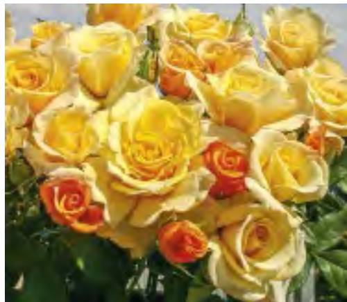
SUNNY SKY® ELEGANZA® cv. 'KORanuli' PP#22,352 Hybrid Tea

Height/Habit: 4' h x 3' w Bloom/Petals: Medium; very full 26-60; pink Foliage: Glossy green Fragrance: Exceptional with fragrance of citron and scents of elder flower