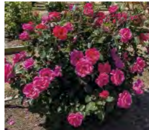
PINK MIRACLE™ cv. 'LGHRT'

Height/Habit: 3-4'; rounded, compact and bushy Bloom/Petals: Up to 4" semi-double; in clusters Foliage: Dark green with red new growth Fragrance: Mild