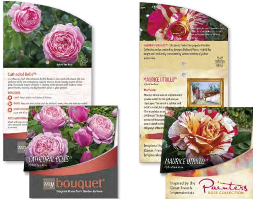
My Bouquet® Fold Tag