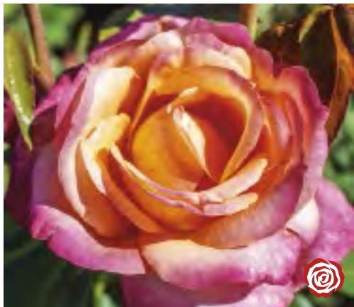
BROADWAY cv. 'BURway'

Height/Habit: 3-5' h x 4' w; Bushy, vigorous Bloom/Petals: 5.5"; 35-40 Foliage: Large, deep green Fragrance: Moderate fruity