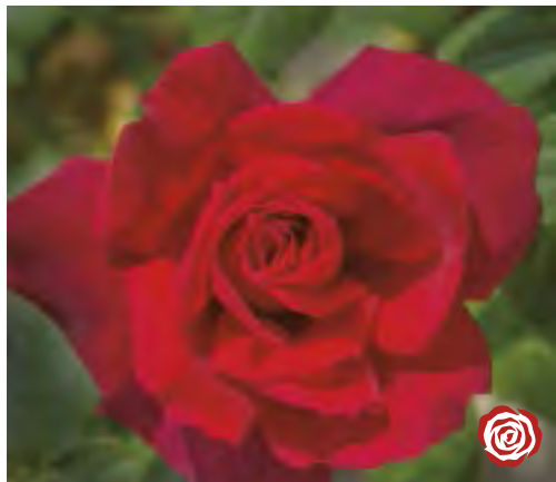
CHRYSLER IMPERIAL Hybrid Tea

Height/Habit: Tall; Upright Bloom/Petals: 5-5.5" high-centered; 50-60 reflexed Foliage: Dark, glossy, leathery Fragrance: Light