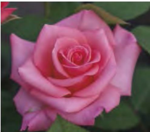
FLAWLESS™ cv. 'BENrye' PP#20,977 Mini-Flora

Height/Habit: Tall, 4-5' h Bloom/Petals: Large, 5-6 inches in diameter; 35 petal count Foliage: Leather, glossy green Fragrance: Fruity