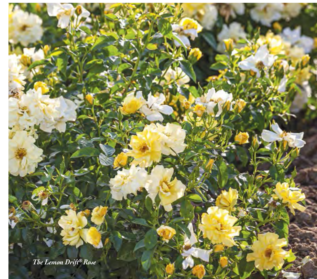
The Lemon Drift® Rose

Height/Habit: 1.5-2.5'; compact Bloom/Petals: 1.5", double Foliage: Medium green, glossy Fragrance: None