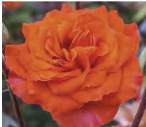
GINGERSNAP cv. 'AROSnap'

Height/Habit: Bushy, vigorous Bloom/Petals: 4-5" high-centered; 28 reflexed Foliage: Large, grey-green, semi-glossy Fragrance: Light