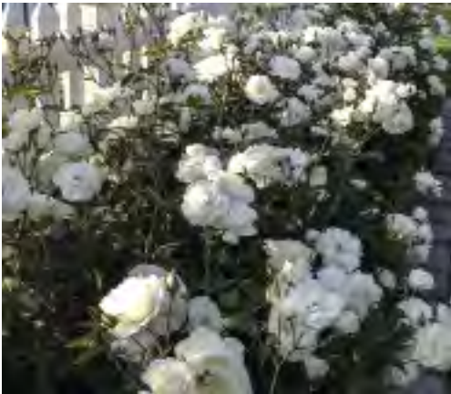
ICEBERG cv. 'KORbin'

WFRS Hall of Fame 1983. A Kordes international best seller and one of the world's most beloved roses, Iceberg is extremely disease resistant and prolific. It has long pointed buds and shapely pure white blooms borne in clusters of up to 15 per spray.