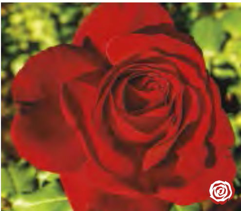
MISTER LINCOLN Hybrid Tea

Height/Habit: 4-5'; upright, bushy Bloom/Petals: 4" high-centered; 20-25 reflexed Foliage: Dark, semi-glossy Fragrance: Rich musk