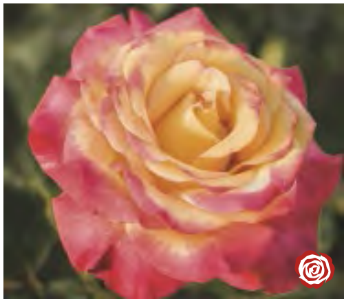
DREAM COME TRUE™ cv. 'WEKdoplot' PP#20,633

Height/Habit: Medium; Upright, bushy, spreading Bloom/Petals: 5.5" high-centered; 30-35 reflexed Foliage: Large, deep green Fragrance: Strong spicy