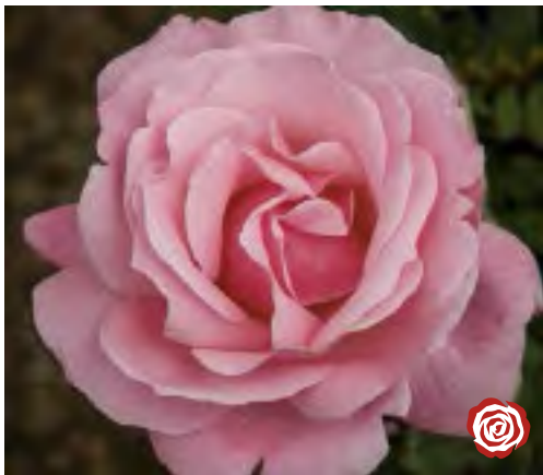
QUEEN ELIZABETH Grandiflora

The pleasing sweet fragrance, the satisfying deep red color, and the stately long stems make this rose a truly striking and highly gratifying addition to the garden. Good in most climates. Height/Habit: Medium; Upright, vigorous Bloom/Petals: Large high-centered; 60 reflexed Foliage: Dark, leathery Fragrance: Moderate