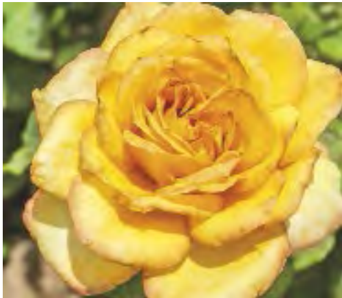
GOLD MEDAL cv. 'AR0yquell'

The plump pointed buds on this bush open into blooms of deep golden yellow with flushed orange-red tips. Performs well in the heat. Disease resistant.