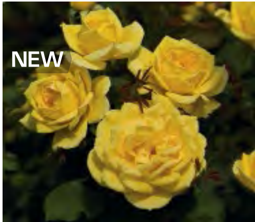
PHYLLIS DILLER Grandiflora

The large rose-pink blooms have a rich sweet fragrance, and the stems are long and strong, which makes this rose delightful in a garden or in a vase. Height/Habit: Medium-tall; Upright, bushy, vigorous Bloom/Petals: Large cupped; 25-30 plain Foliage: Large, leathery Fragrance: Intense