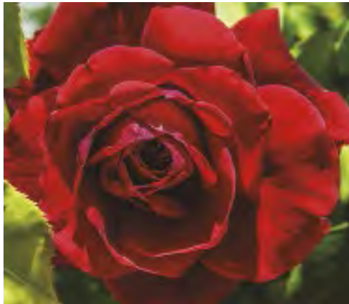
CL. DON JUAN Climber

Height/Habit: 8-10' Bloom/Petals: 2-3" cupped; 20-25 plain Foliage: Medium green Fragrance: Light