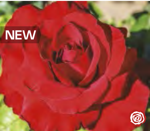
OPENING NIGHT cv. 'JAColber' PP#11,265

Height/Habit: Medium-tall; Upright, bushy, vigorous Bloom/Petals: 4.5-5" high-centered; 30-35 reflexed Foliage: Grey-green, matte Fragrance: Light fruity