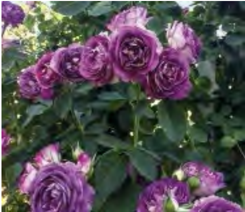
CL. LAVENDER CRUSH™ cv. 'TEXmourug'

Height/Habit: Climbing canes of 8 to 10' Bloom/Petals: Ruffled, in large clusters Foliage: Glossy, deep green Fragrance: Mild fruity