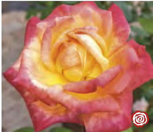
ARIZONA cv. 'Werina'

Height/Habit: Up to 3'; Low, bushy Bloom/Petals: 3.5-4" cupped; 25-30 ruffled Foliage: Dark, glossy, leathery Fragrance: Intense lemon