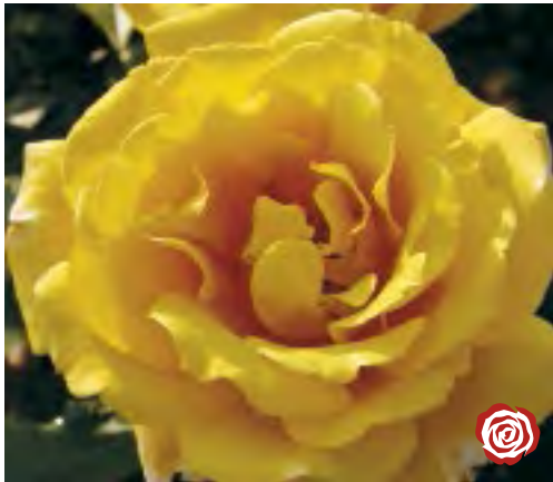
CL. GOLDEN SHOWERS Large-flowered Climber

Height/Habit: 6-10' Bloom/Petals: 5" cupped; 30-35 reflexed Foliage: Dark, glossy, leathery Fragrance: Intense