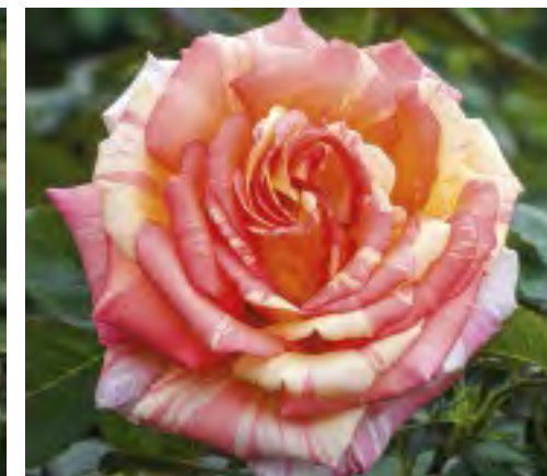
PEACH SWIRL™ cv. 'TEXpeaswi'

Height/Habit: 3-4'; upright, bushy Bloom/Petals: Double, 3-4 inch clusters Foliage: Lush glossy green Fragrance: Moderate