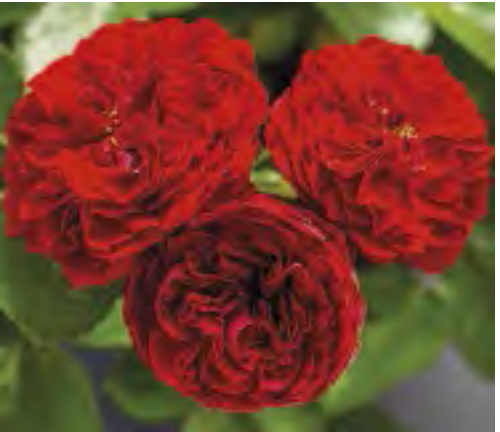
ROXANNE™ VERANDA® cv. 'KORfio46' PP#26,286

Height/Habit: 2.5'-3'w x 2'h compact Bloom/Petals: Double cupped flower constant bloom Foliage: Medium green Fragrance: Light