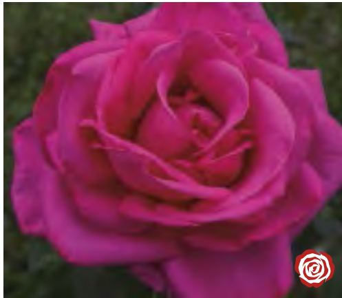
MISS ALL AMERICAN BEAUTY cv. 'MEdauid'

Height/Habit: 4-6'; medium to medium tall Bloom/Petals: 5" Fully double, old fashioned Foliage: Rich grey-green Fragrance: Intense rose & fruit