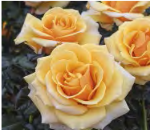
ST TROPEZ™ cv. 'ORAsyda'

Height/Habit: 3-4' h Bloom/Petals: Large, 5-inch diameter Foliage: Dark green, semi-glossy Fragrance: Intense sweet rose