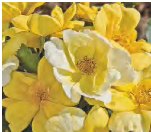
SUNNY KNOCK OUT® ROSE cv. 'RADsunny' PP#18,562

Height/Habit: 1-2'; compact Bloom/Petals: 1.5", clusters Foliage: Medium green, glossy Fragrance: None