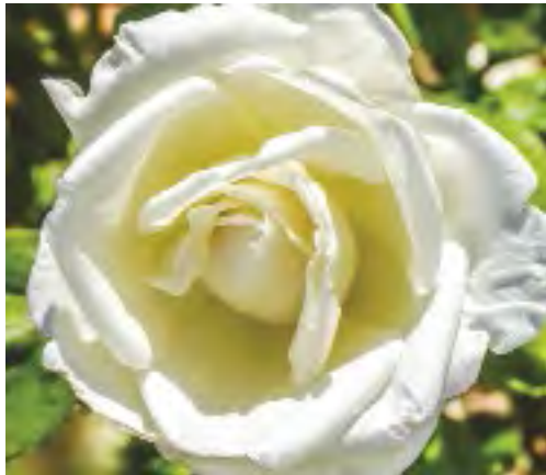
WHITE MAGIC Hybrid Tea

Height/Habit: Medium-tall; Upright, vigorous Bloom/Petals: 4-5" high-centered; 25-30 reflexed Foliage: Dark, semi-glossy, leathery Fragrance: Intense fruity