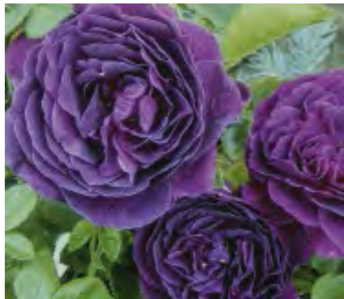
EBB TIDE™ cv. 'WEKsmopur'

Height/Habit: Tall; Upright, bushy, vigorous Bloom/Petals: Large; 40 Foliage: Dark, matte Fragrance: Mild tea