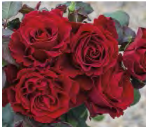
DANCING IN THE DARK™ cv. 'DELchifrou'