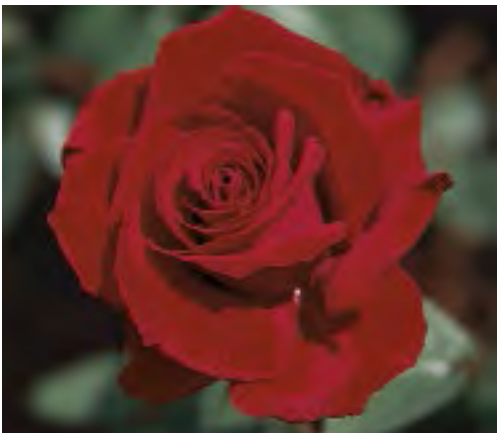
O. L. WEEKS

Height/Habit: 5-6'; upright Bloom/Petals: 4"; 35 Foliage: Medium size, medium green, matte Fragrance: Moderate