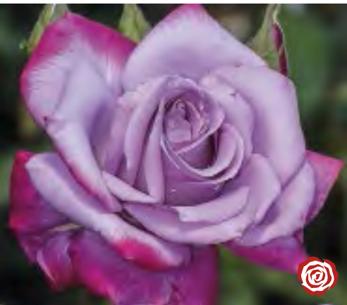
PARADISE cv. 'WEZip'

Height/Habit: Medium; Bushy, vigorous, Bloom/Petals: 4-5.5" high-centered; 40-45 reflexed Foliage: Dark, matte, leathery Fragrance: Intense rose