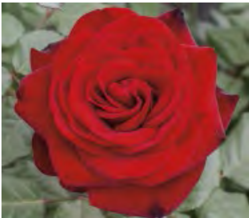
FOREVER YOURS™ cv. 'TAN08242' Hybrid Tea

Height/Habit: 2-3' h Bloom/Petals: Medium; double 17-25 Foliage: Large, glossy, dark green Fragrance: Strong