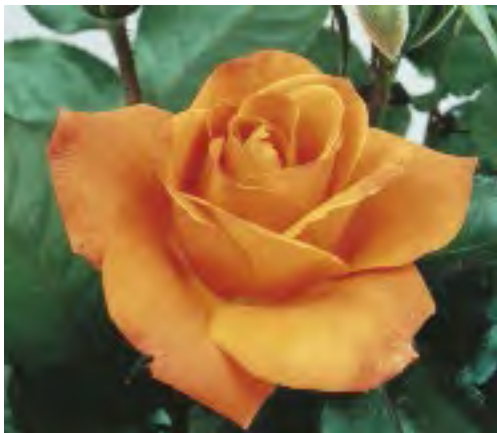
CL. NEW YEAR Large-flowered Climber

Height/Habit: 8-10' Bloom/Petals: 3.5" open; 23-28 plain Foliage: Glossy, apple green Fragrance: Light tea