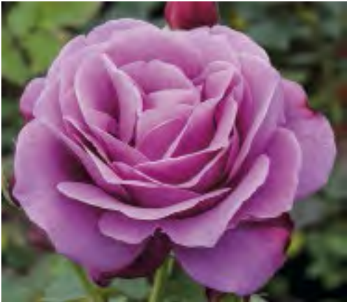
HEIRLOOM cv. 'JACloom'

This hybrid tea has inherited an endearing charm that never goes out of style. The magenta buds develop into deep lilac-purple blooms that have a wonderful perfume reminiscent of sweet raspberries and wine.