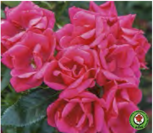
FLAMINGO™ KOLORSCAPE® cv. 'KORhopiko' PP#23,529

Height/Habit: 3 1/2' h x 2 1/2' w Bloom/Petals: Cupped peony style; full 40+; cream/pink Foliage: Glossy green Fragrance: Exceptional with citrus and raspberry scents