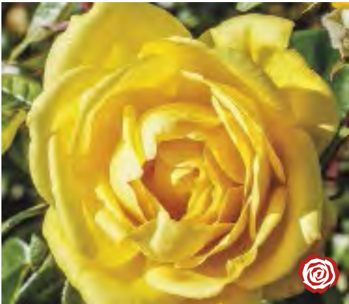
OREGOLD cv. 'TANolj'

Height/Habit: 4-5'; upright, slightly spreading Bloom/Petals: 5-5.5" high-centered; 25-30 reflexed Foliage: Large, dark, semi-glossy Fragrance: Mild fruity