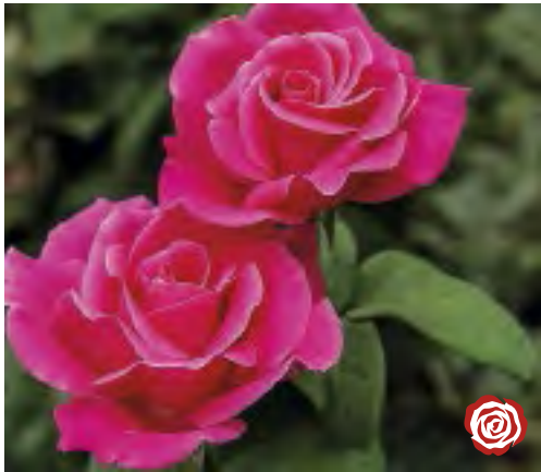
PERFUME DELIGHT Hybrid Tea

The large rose-pink blooms have a rich sweet fragrance, and the stems are long and strong, which makes this rose delightful in a garden or in a vase. Height/Habit: Medium-tall; Upright, bushy, vigorous Bloom/Petals: Large cupped; 25-30 plain Foliage: Large, leathery Fragrance: Intense