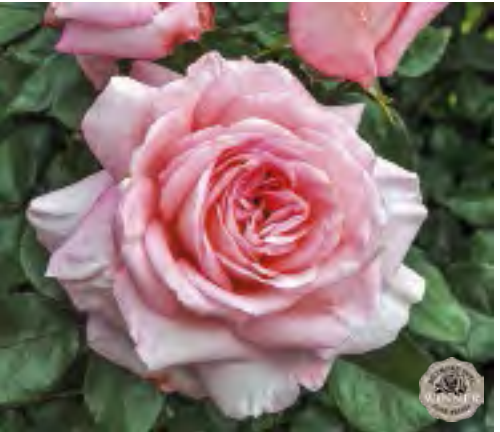
SAVANNAH™ SUNBELT® cv. 'KORvioros' PP#26,285

Height/Habit: 2'; slightly spreading Bloom/Petals: 2"; full, double; 41+ Foliage: Medium, semi-glossy Fragrance: Mild