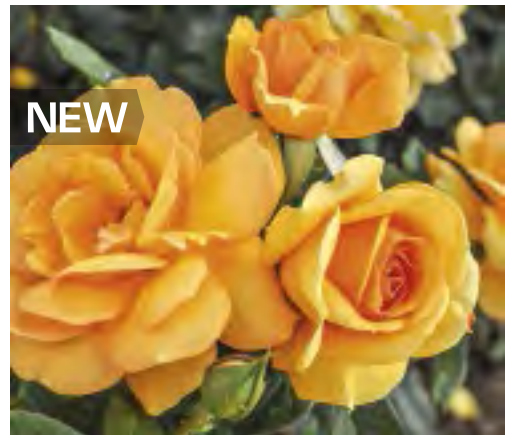
SOUTH AFRICA® SUNBELT® cv. 'KORberbeni' Floribunda

The South Africa Sunbelt rose is a heavy bloomer with vibrant, sunny tones. Peachy yellow roses rebloom in late spring, summer, and fall. These lush blooms are heavily petaled and non-fading. Recipient of the Gold Standard award and Glasgow Gold Medal.