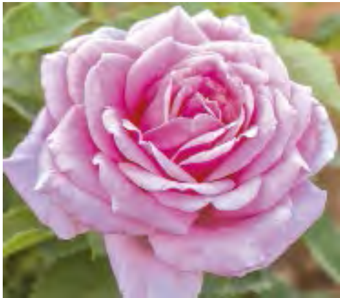
BELINDA'S DREAM Floribunda Shrub

No, it isn't a dream. This variety really does combine the form of a hybrid tea with the free-flowering habit of a floribunda and the hardiness and vigor of a shrub - all in one bush! And the blooms are worth repeating: borne in small clusters, they are large and perfectly cupped with medium pink petals and a scrumptious raspberry fragrance. Very disease resistant. Height/Habit: 5' h x 4' w; Bushy Bloom/Petals: 3.25-4.25" cupped; 40+ reflexed Foliage: Medium green, matte Fragrance: Moderate raspberry