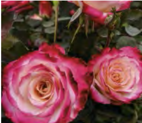
WHITE LIES™ cv. 'Pot3'

Height/Habit: 3-4'; upright, bushy Bloom/Petals: 5"; double, ruffled Foliage: Medium green & glossy Fragrance: Intense licorice candy