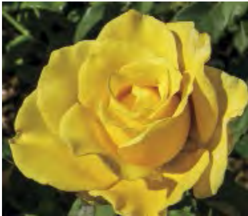
NEW DAY cv. 'KORgold'

A proven customer favorite, this disease resistant and winter hardy hybrid tea produces exceptional mimosa-yellow flowers that have good form and a spicy fragrance. Blooms continuously through the season.