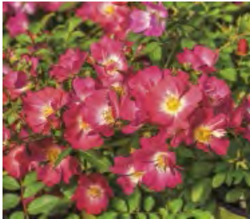
PINK DRIFT® ROSE Shrub

A bright bubblegum-pink version of Double Knock Out. The bush blooms continuously from early spring to the first frost, and it is disease resistant and drought and heat tolerant. Height/Habit: 3-4' h x 3-4' w; Bushy, rounded Bloom/Petals: Medium-small; 15-20 Foliage: Dark mossy green Fragrance: None