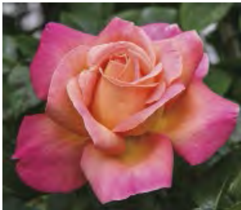
CHICAGO PEACE cv. 'JOHnago'

Height/Habit: Medium-tall; Bushy, rounded, vigorous Bloom/Petals: 4" cupped; 20-25 reflexed Foliage: Semi-glossy Fragrance: Mild honey