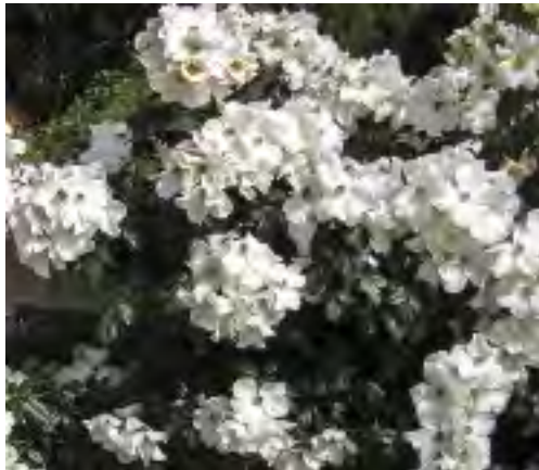
CL. SALLY HOLMES Climber

Height/Habit: 5-7' Bloom/Petals: 4-5" cupped; 30-35 reflexed Foliage: Large, dark, glossy Fragrance: Moderate fruity