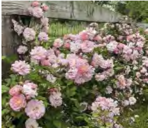
CL. PERFUME BREEZE™ cv. 'BARise'

Height/Habit: Climbing canes of 8-10' Bloom/Petals: Medium; very full 40+; Old fashioned Foliage: Rich gray-green Fragrance: Strong