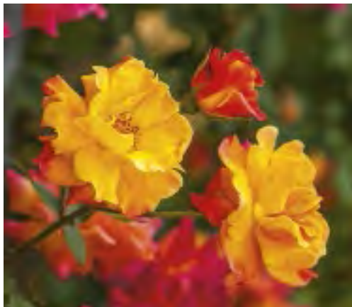
CL. JOSEPH'S COAT Large-flowered Climber

Height/Habit: 8-10' Bloom/Petals: Medium open; 20-25 reflexed Foliage: Dark Fragrance: Mild sweet