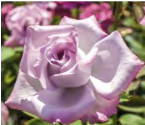
BLUE GIRL cv. 'KORgi' PPAF

Height/Habit: Upright, bushy, vigorous Bloom/Petals: 2-2.5" high-centered; 40-50 reflexed Foliage: Dark, glossy, leathery Fragrance: Light fruity