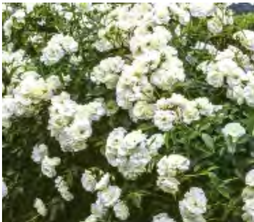
CL. ICEBERG Climber

Height/Habit: 8-10', bushy and vigorous Bloom/Petals: 3.5-4" open; 5-8 plain Foliage: Dark, glossy Fragrance: Light