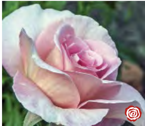
TIFFANY Hybrid Tea

Height/Habit: 3-4' h x 4' w; Upright Bloom/Petals: 3" flat; 25-30 reflexed Foliage: Light green Fragrance: Intense