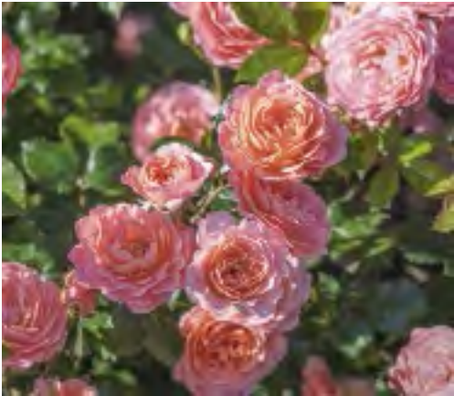
APRICOT DRIFT® cv. 'Meimirote' PP#23,354 Shrub

A full, bushy habit is signature, but highly variable, in the size of shrubs as well as the size and form of the blooms. They are free flowering, vigorous, disease resistant, hardy, and easy to grow. Use in mixed beds, hedges, or borders.