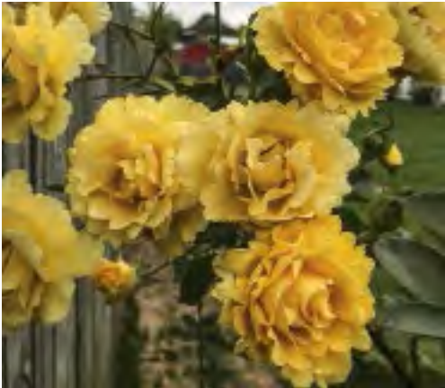
CL. GOOD DAY SUNSHINE™ cv. 'TEXrisu'

My Climbing roses make a stunning addition to the garden and are perfect on trellises, walls, pillars and over arbors. The collection features exceptional roses that are repeat bloomers and vigorous climbers that can reach up to 10 feet in height. Each my Climbing variety brings a sense of drama to the landscape while filling the air with unforgettable fragrance.