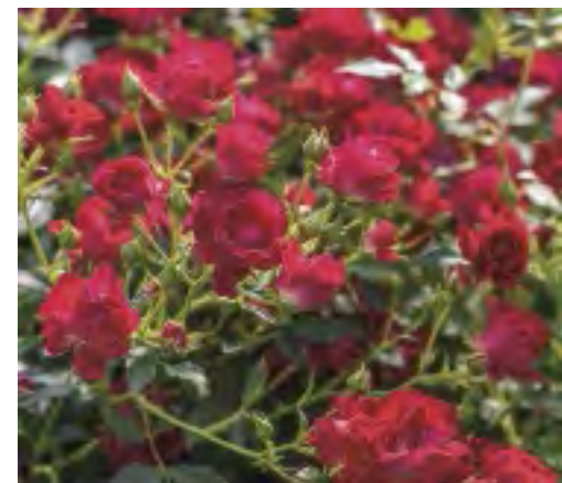
RED DRIFT® ROSE cv. 'MEIgalpio' PP#17,877