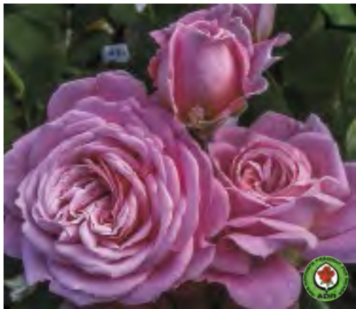
SUMMER ROMANCE® PARFUMA® cv. 'KORtekcho' PP#25,993 Floribunda

Height/Habit: 4' h x 2' w; tree form Bloom/Petals: Large, cupped; 17-25 petals Foliage: Dark green, glossy Fragrance: Moderate