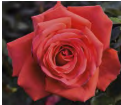
FRAGRANT CLOUD cv. 'TANellis'

Height/Habit: Medium-tall; Upright, vigorous Bloom/Petals: 5.5-6" high-centered; 25-30 reflexed Foliage: Large, dark, leathery Fragrance: Moderate tea