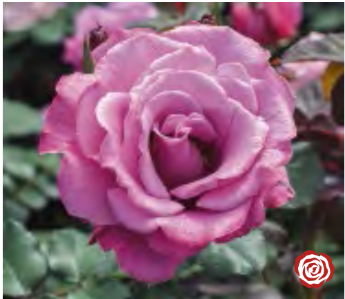
ANGEL FACE Floribunda

CERTIFIED INTROS NEW EXCLUSIVES NEW OFFERINGS FRAGRANT OWN ROOT