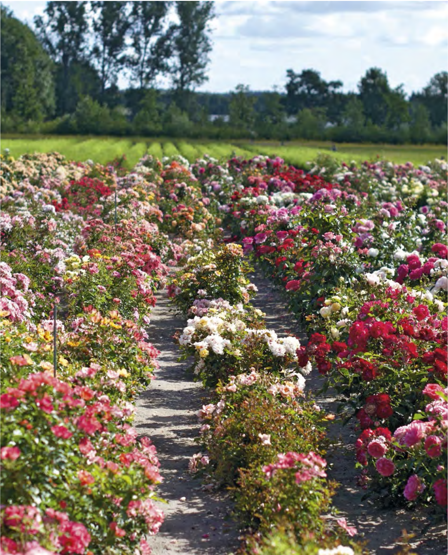
Interplant's rose fields in Harmelen, Netherlands