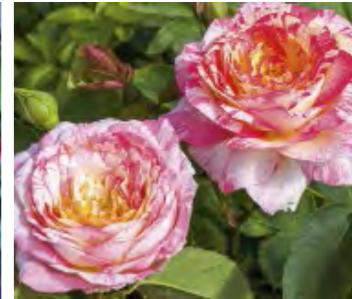
MARC CHAGALL™ cv. 'DELstrijac'

Height/Habit: 3-4'; compact Bloom/Petals: 3-4"; double, clustered; 16-25 Foliage: Medium, glossy Fragrance: Mild apple