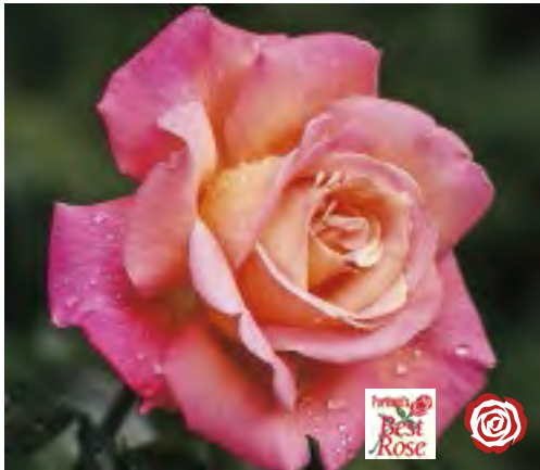
LOVE & PEACE™ cv. 'BALpeace' PP#14,731

Height/Habit: 3-5' h x 4' w; Upright Bloom/Petals: 3.5" high-centered; 35 reflexed Foliage: Dark, glossy, red new growth Fragrance: Light rose