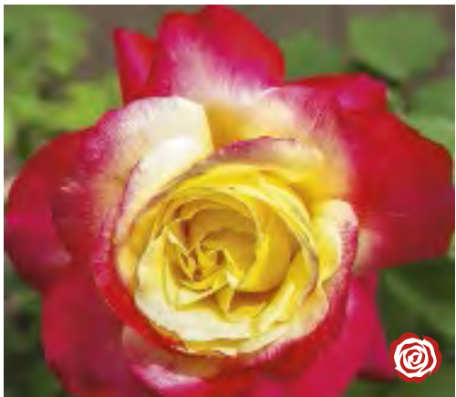
DOUBLE DELIGHT cv. 'ANDeli'

Height/Habit: Medium; Upright, vigorous Bloom/Petals: 5" high-centered; 25-30 reflexed Foliage: Dark, glossy Fragrance: Intense damask, fruity, spicy, citrus