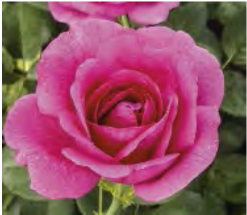
DELLA REESE™ cv. 'WEKrorobluni'

This angelic rose displays large, full, heavenly scented blooms in shades of fuchsia and magenta. The blooms are borne singly on long stems adorned in glossy, dark green foliage and make outstanding cut flowers.