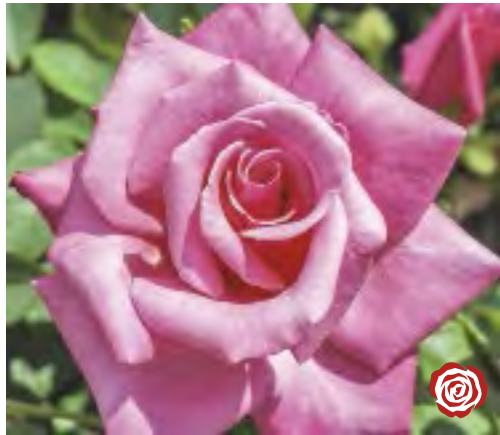
FIRST PRIZE Hybrid Tea

Height/Habit: Medium; Rounded, vigorous Bloom/Petals: 3" clusters, 25-30 petals Foliage: Bronze-green to dark green Fragrance: Light tea