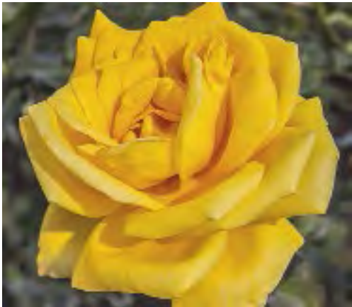
CL. ROYAL GOLD Large-flowered Climber

Height/Habit: 8-10' Bloom/Petals: 3" cupped; 25-30 Foliage: Medium green, glossy Fragrance: Light