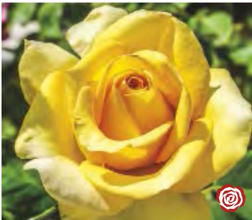
ST PATRICK™ Hybrid Tea

This 1982 AARS winner has ovoid buds, borne in clusters of 1 to 3, that open to very full blooms saturated in orange, salmon pink, and coral. Excellent cut rose. Height/Habit: 4-6' h x 3-4' w; Upright, vigorous Bloom/Petals: 3.5-4.5" high-centered; 50 reflexed Foliage: Dark olive-green Fragrance: Light tea