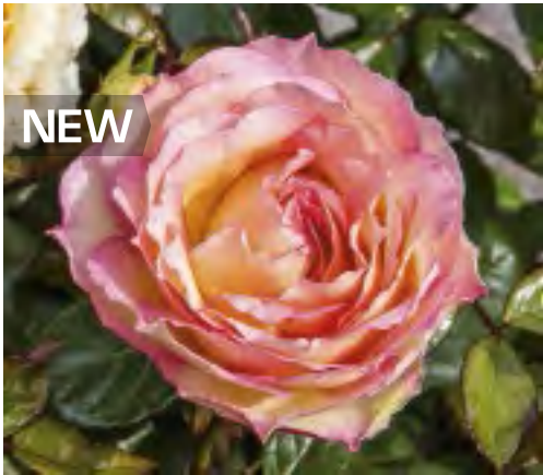
EUPHORIA™ cv. '1PB065013' Hybrid Tea

Euphoria is what you'll experience with this easy, ground-hugging rose! Vigorous with continuous production of peachy-orange blooms and a low, creeping habit make this rose a winner. Use as a ground cover, in containers or borders.