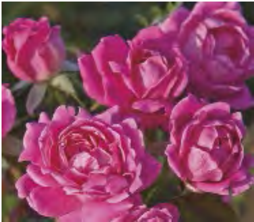
PINK DOUBLE KNOCK OUT® ROSE Shrub

One of the more floriferous dwarf shrubs available with soft peach blooms that cover the plant from mid-spring to the first freeze. Peach Drift works well in perennial gardens and has very strong disease resistance. Height/Habit: Low groundcover Bloom/Petals: 1.5", clusters Foliage: Semi glossy, dark green Fragrance: None