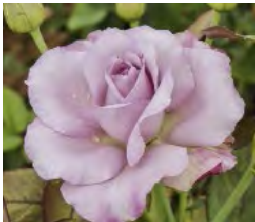
MOONLIGHT MAGIC Hybrid Tea

Height/Habit: Medium; Upright, bushy, spreading Bloom/Petals: 4.5-5.5" cupped; 38 reflexed Foliage: Medium green, semi-glossy Fragrance: Light spicy