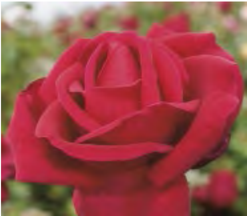
RED MASTERPIECE Hybrid Tea

A half-century after its introduction, this rose remains popular. What gives a rose such staying power? It must be the harmonious agreement of the magnificent deep pink blooms, the intense rose fragrance, and the elegant long stems. Height/Habit: Tall; Bushy, vigorous Bloom/Petals: 4.5-6" cupped; 50+ reflexed Foliage: Matte, leathery Fragrance: Intense rose