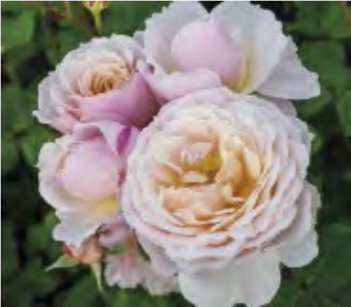
MOONLIGHT IN PARIS™ cv. 'DElanac'

Warm pastel tones of peach and pink open into shades of cream white. Large clusters of medium size double flowers put on a great show. Strong disease resistance, deep glossy green leaves and strong vigor.