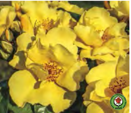
LEMON FIZZ™ KOLORSCAPE® cv. 'KORTizlem' PP#24,195

Height/Habit: 3' h x 2 1/2' w; Compact, mounding Bloom/Petals: Approx. 20 petals; semi-double Foliage: Dark green, glossy Fragrance: None