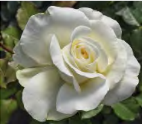
SHIRLEY'S BOUQUET™ cv. 'ORAvolmon'

Height/Habit: 4-5'; bushy Bloom/Petals: 3-4"; fully double, cupped; 40+ Foliage: Medium green Fragrance: Strong honey