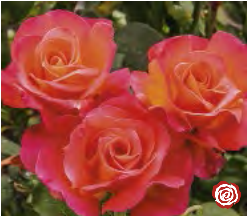
MIKADO cv. 'KOHsai'

Height/Habit: 4-5', upright, bushy Bloom/Petals: 5" high-centered; 40+ Foliage: Medium, dark, glossy Fragrance: Mild