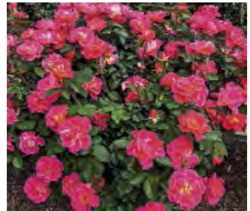
CORAL MIRACLE™ cv. 'RIPfirst' PPAF

Height/Habit: 3-4' Bloom/Petals: 3-4" Semi Double, in clusters; 12-14 Foliage: Dark green Fragrance: Mild