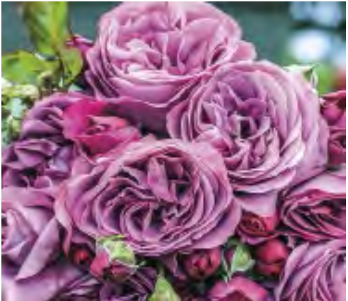
PLUM PERFECT™ SUNBELT® cv. 'KORvodaom' PP#22,691

Height/Habit: 3' h x 2 1/2' w; Upright, bushy Bloom/Petals: Approx. 20 petals; semi-double Foliage: Dark green, glossy Fragrance: Light