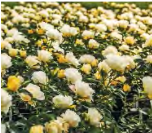
POPCORN DRIFT® Shrub

A continuously blooming compact and easy to grow bush with bright pink blooms. Disease resistant, drought tolerant, and self-cleaning. Height/Habit: 3-4' h x 3-4' w; Bushy, rounded Bloom/Petals: Medium; 5-7 Foliage: Deep mossy green Fragrance: None