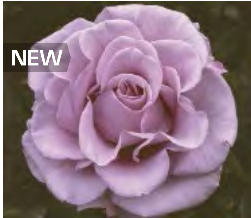
LAGERFELD cv. 'AR0laquell'

Large-flowered Grandiflora features 4 to 5-inch flowers that are a lavender-mauve blend and open with high centers. Plant blooms continuously through summer and autumn. Strong spicy-sweet fragrance.