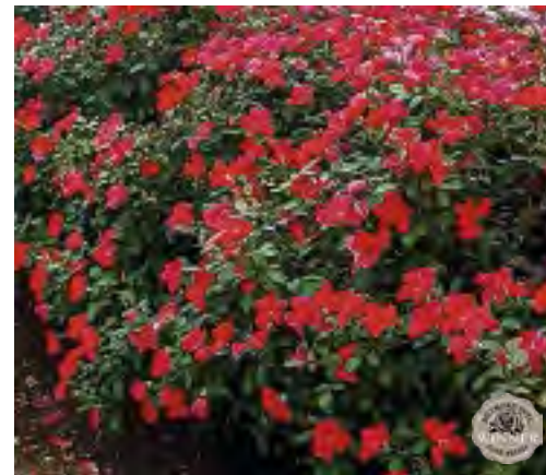
MIRACLE ON THE HUDSON™ cv. 'LGHRT'