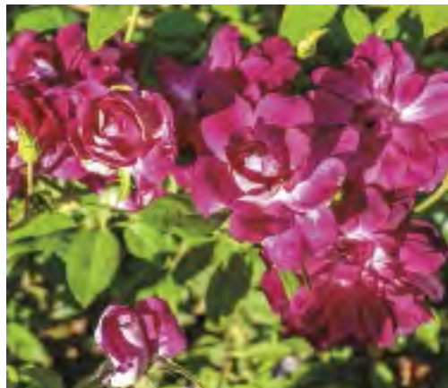
BURGUNDY ICEBERG™ cv. 'PROse' PP#16,198

Height/Habit: Medium-tall; Upright, vigorous Bloom/Petals: 4-4.5" high-centered; 30-35 reflexed Foliage: Medium, dark, semi-glossy Fragrance: Strong spice & damask