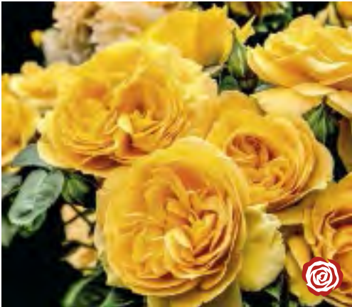
JULIA CHILD cv. 'WEKvossutono' PP#18,473

You might expect a rose named after Julia Child to be somewhat unconventional, but not so with this floribunda. Unconventional? No. Extraordinary? Yes. Julia Child serves up yummy butter-gold blooms that emit a sweet-smelling licorice aroma. Free flowering, hardy, and disease resistant. . . Extraordinary!