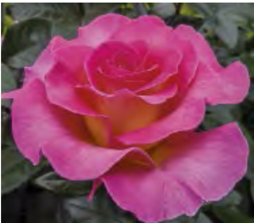
JULIE ANDREWS cv. 'DELfluros' Hybrid Tea

Height/Habit: 5-7'; bushy, upright Bloom/Petals: 4-5"; fully double; 20-25 Foliage: Dark green Fragrance: Moderate