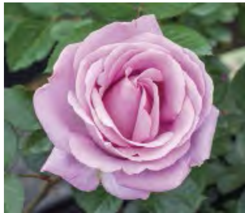
LE PETIT PRINCE™ cv. 'DELgramau'

Height/Habit: 3-4', upright Bloom/Petals: Pointed and elegant; approx. 20-25 petals Foliage: Dark green Fragrance: Mild