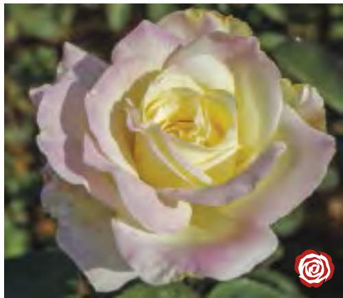
GARDEN PARTY Hybrid Tea

Height/Habit: 4-5'; upright Bloom/Petals: 4-5"; double; 20-25 Foliage: Deep green Fragrance: Strong, fruity