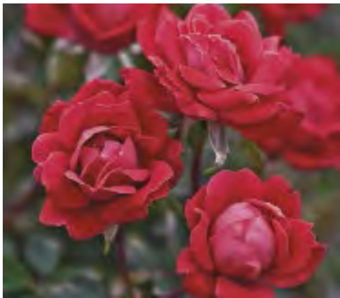
DOUBLE KNOCK OUT® ROSE Shrub

Deep pink flowers with a soft faded center bloom in abundance throughout the season. This low-growing shrub is easy to care for and has strong disease resistance. Best used in border plantings and as companion plants in perennial gardens. Height/Habit: Low groundcover Bloom/Petals: 1.5" clusters Foliage: Semi glossy, dark green Fragrance: None