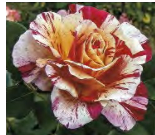
MAURICE UTRILLO™ cv. 'DELstavi'

Height/Habit: 2-3'; upright, bushy Bloom/Petals: 3-4"; fully double, approx. 30 Foliage: Light green Fragrance: Slightly fruity