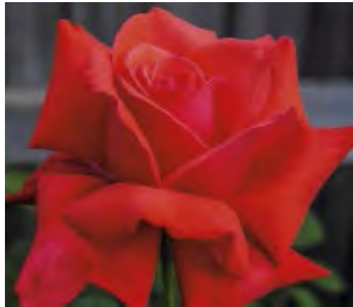
DOLLY PARTON Hybrid Tea

Height/Habit: 5' h x 3-4' w; Bushy, broadly rounded Bloom/Petals: 4-5"; 25-30 Foliage: Dark, very glossy Fragrance: Moderate cinnamon spice