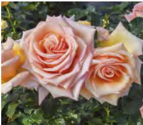
BEAUTIFUL DAY™ cv. 'FRYTropic' Hybrid Tea

Height/Habit: 2-3' h Bloom/Petals: Medium; full 26-40; Yellow Foliage: Medium, semi glossy, dark green Fragrance: Mild