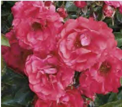
CORAL DRIFT® ROSE Shrub

These abundant precious brilliant yellow blooms show off their vivid orange stamens and don't fade in the heat. Use as a hedge, a foundation plant, or in a mixed planting. Height/Habit: 3-4' h x 3-4' w; Compact, mounding Bloom/Petals: Medium; 9-15 Foliage: Medium green, satin Fragrance: Light spice